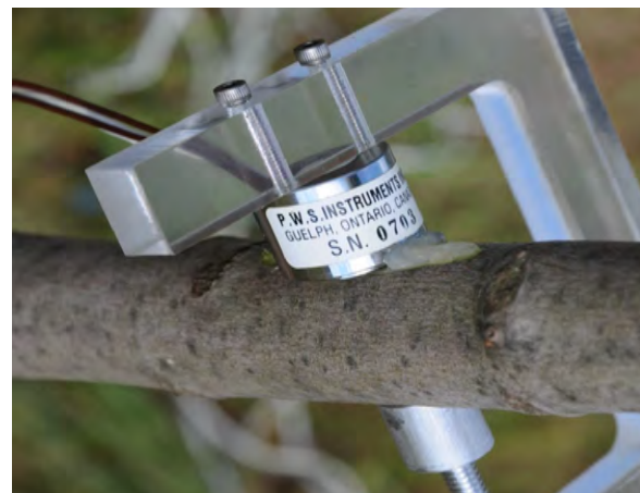
PSY1 Stem Psychrometer attached to tree branch.