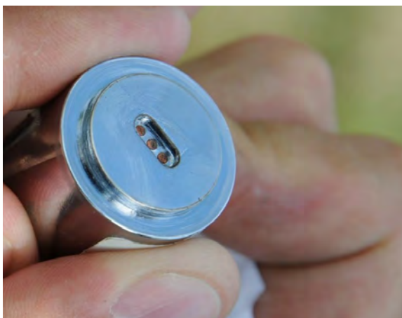
Chamber of PSY1 Stem Psychrometer sensor.

It is recommended that a full 6 point calibration (0.1, 0.2, 0.3, 0.4, 0.5 and 1.0 Molal NaCl solutions) be performed every 6 to 12 months or immediately following a serious contamination and cleaning of the chamber. The need for a full calibration and or change of calibration can then be determined using the integrated calibration function of the utility software. Calibrations should be performed both within the range of expected water potentials and at a range of expected temperatures. An extreme environment calibration range (1.2 to 2.0 Molal equivalent to -6 to -10 MPa) is included to facilitate this.